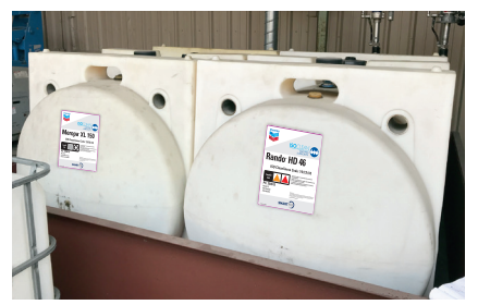
Chevron SmartFill<sup>™</sup> labels ensure the correct Chevron Certified lubricant is installed.